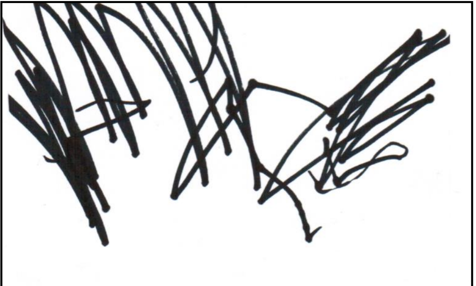
Early mark making