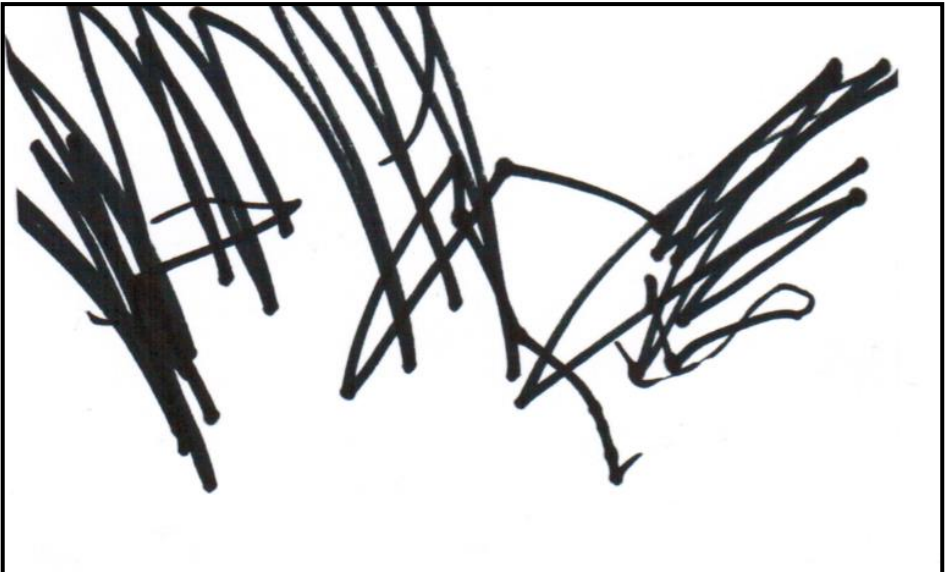
Early mark making